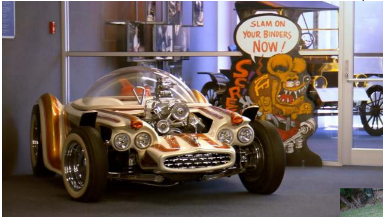
A Rat Fink chopped car. Creating wonders with fiberglass.

In the 60s Ed "Big Daddy" Roth was known for his elaborate chopped cars. He made some of the most unique hot rods that had ever been seen. His cars brought people from miles around to car shows to see what Big Daddy had cooked up this time.