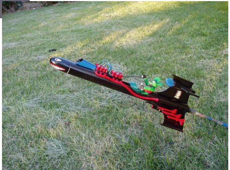
The Tribute to the Rat Fink rocket.

As a kid, I built Rat Fink models, sometimes modifying them to suit my own needs. For example, the Football Fink had my dad's college numbers and colors, which pleased him to no end. And, while I have not made a Rat Fink model in many years, they have all held a special place in my memory. So, this year, I put my imagination to work and created the Tribute to the Rat Fink rocket.