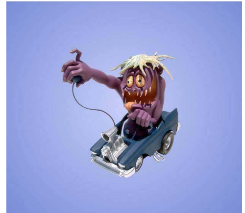
One of the Rat Fink models.

Rat Fink. They drivers generally featured bulging, bloodshot eyes, toothy grins, and muscles poking out all over. The cars always had a huge melty looking engine and a gear shift knob that stood as tall as the driver.